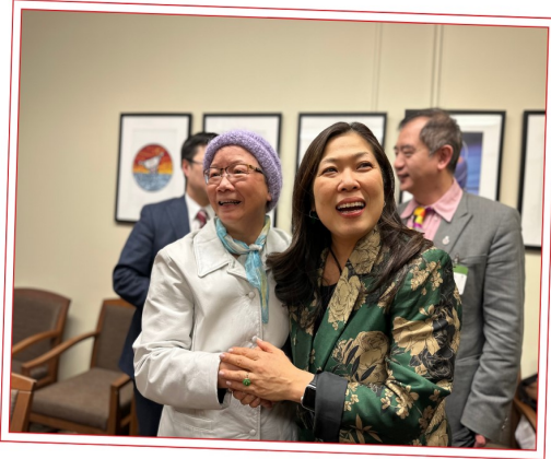
Lunar New Year