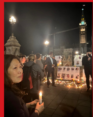
Hon. Mary Ng holds a candle to demonstrate her support for the women of Iran.

Our government stands shoulder to shoulder with the women of Iran and will always stand up for human rights around the world.