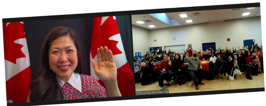
New Year's Levee 2023