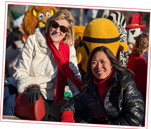
Markham Santa Claus Parade