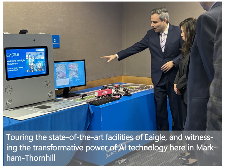
Touring the state-of-the-art facilities of Eagle, and witnessing the transformative power of AI technology here in Markham-Thornhill

Budget 2024's measures help protect jobs and encourage growth by: