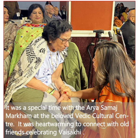
It was a special time with the Arya Samaj Markham at the beloved Vedic Cultural Centre. It was heartwarming to connect with old friends celebrating Vaisakhi.