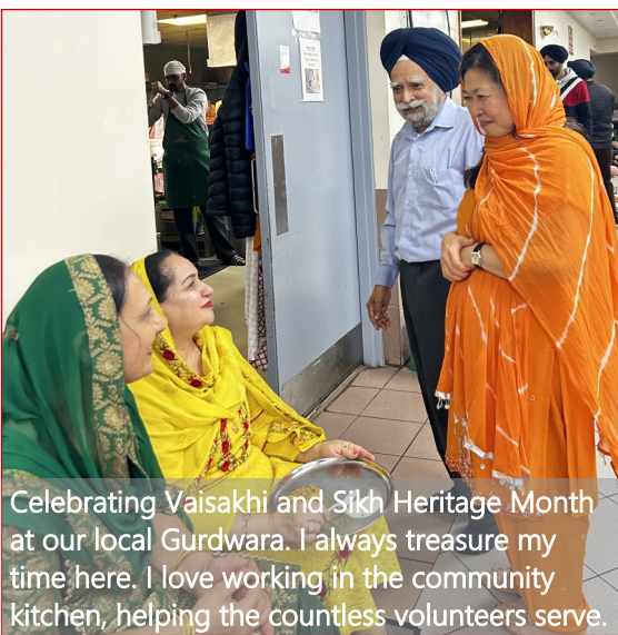
Celebrating Vaisakhi and Sikh Heritage Month at our local Gurdwara. I always treasure my time here. I love working in the community kitchen, helping the countless volunteers serve.