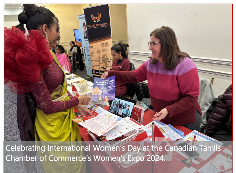
Celebrating International Women's Day at the Canadian Tamils Chamber of Commerce's Women's Expo 2024.