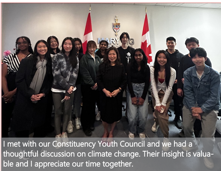
I met with our Constituency Youth Council and we had a thoughtful discussion on climate change. Their insight is valuable and I appreciate our time together.