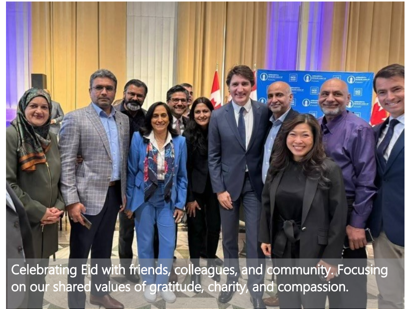
Celebrating Eid with friends, colleagues, and community. Focusing on our shared values of gratitude, charity, and compassion.

I am truly grateful for the compassion and generosity of the people of Markham-Thornhill.