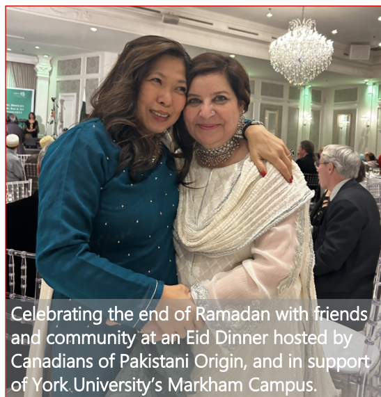
Celebrating the end of Ramadan with friends and community at an Eid Dinner hosted by Canadians of Pakistani Origin, and in support of York University's Markham Campus.