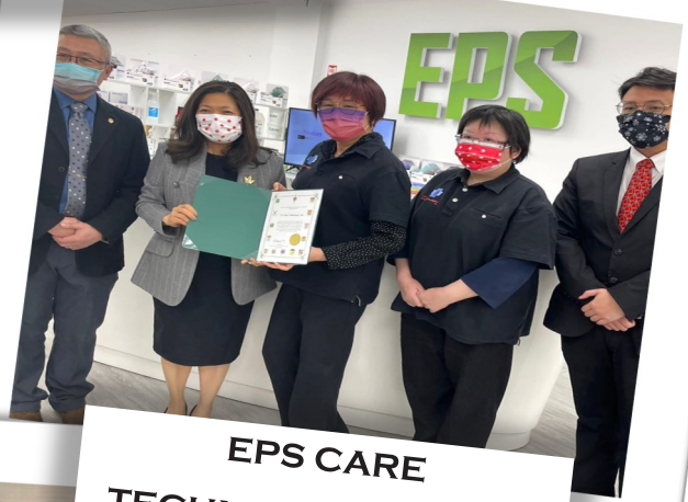
EPS CARE TECHNOLOGIES VISIT