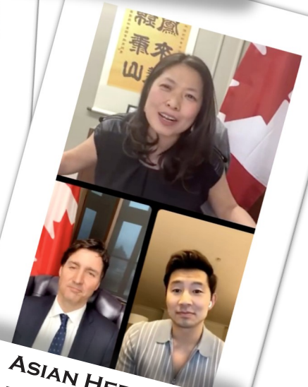
ASIAN HERITAGE MONTH WITH PM TRUDEAU AND SIMU LIU