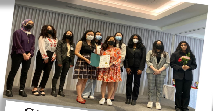
CANADA YOUTH CHAMPIONS