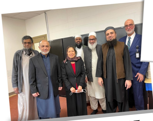
ISLAMIC SOCIETY OF MARKHAM VISIT