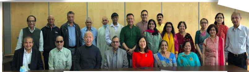
SANATAN MANDIR CULTURAL CENTRE