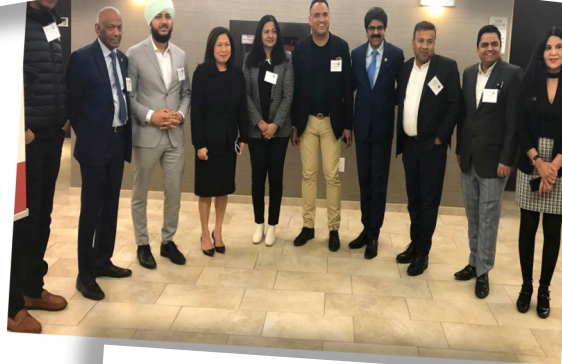
CANADA INDIA FOUNDATION