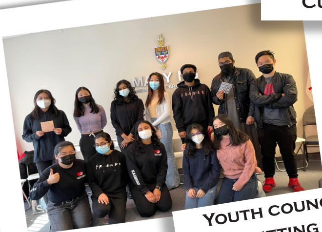
YOUTH COUNCIL MEETING