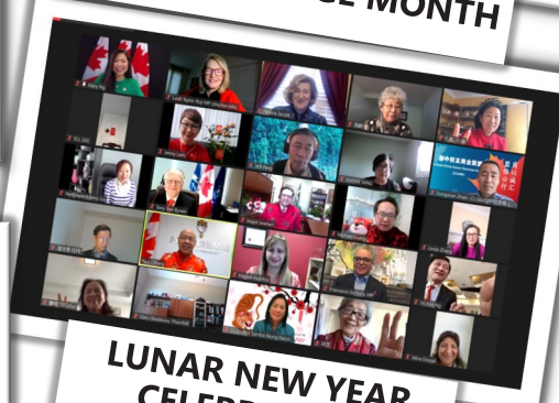
LUNAR NEW YEAR CELEBRATION