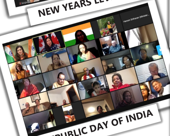
REPUBLIC DAY OF INDIA