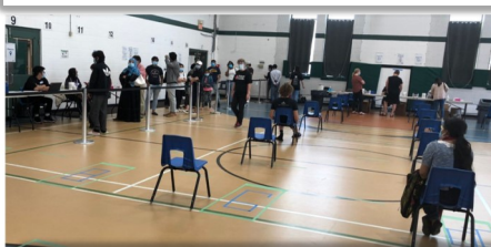
ISLAMIC SOCIETY FAMILY GAME DAY