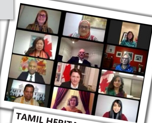
TAMIL HERITAGE MONTH