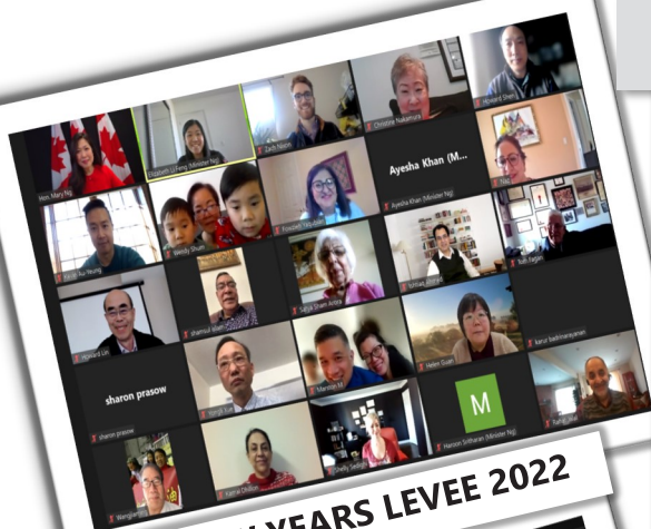
NEW YEARS LEVEE 2022