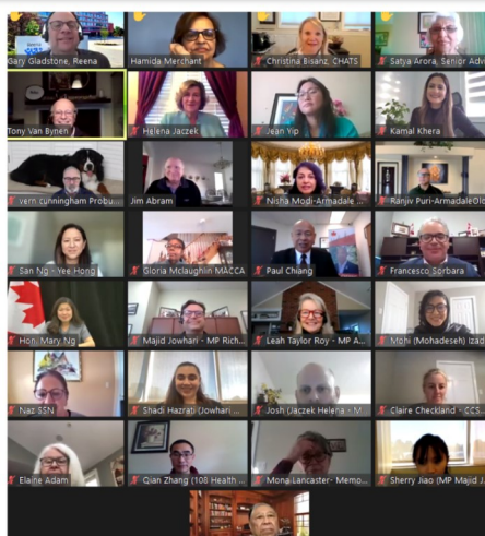
YORK REGION SENIORS TOWN HALL