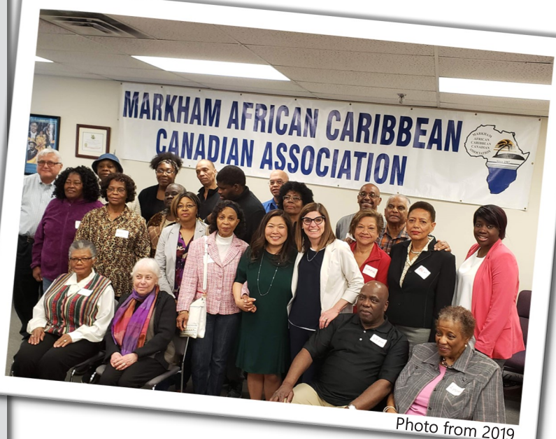
Photo from 2019

In Markham-Thornhill, for over 30 years MACCA has brought together Black Canadians in our community—creating a space to feel welcome, heard, and celebrated, and to have needed conversations on topics such as Anti-Black Racism, and how we can take action. A big thank you to MACCA, and the countless other Black-Canadian leaders and organizations for your continued advocacy in our community!