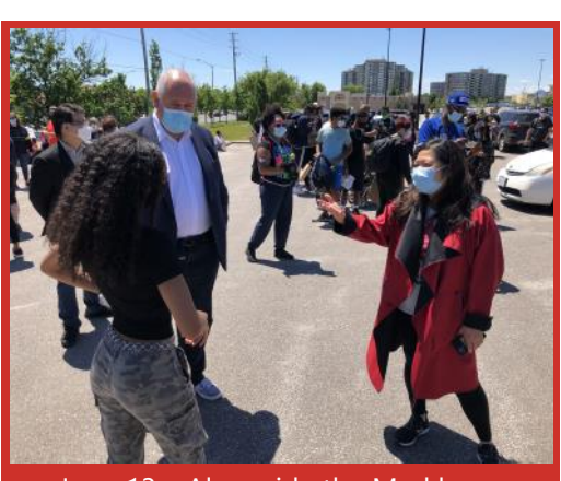
June 13—Alongside the Markham community, I joined the Black Lives Matter march to support Black Canadians and the fight against systematic anti-Black racism.