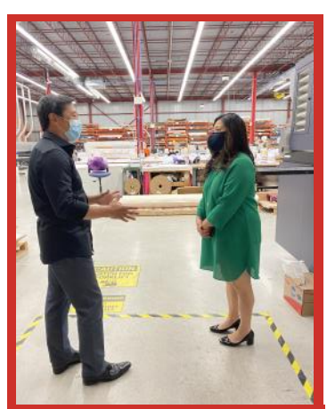
June 6—Visited local business ICON Digital to learn how retooled to produce muchneeded personal protective equipment.