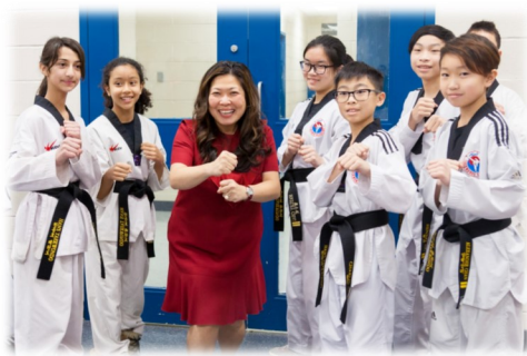
Our New Year's Levee